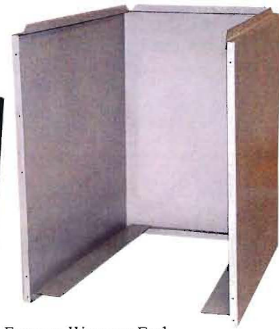
Furnace Wrapper End Forming Front Flanges & Tangent Forming into three (3) Sided Wrapper. 22 Ga. Pre-Painted