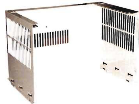
Air Conditioner Pre-Painted 3 Sided Wrapper with Inline Toggle Lock Corners